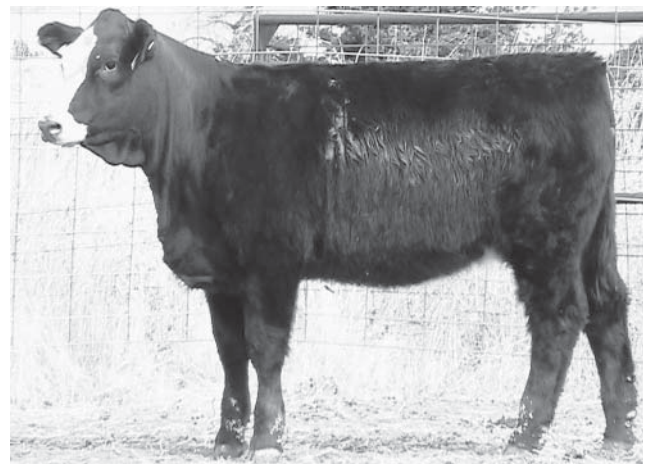
Lot 102 173U

GW LUCKY DICE 187H HOOKS MAJESTIC 31M HOOKS KOKO 11K SRS FORTUNE 500 KD MS FORTUNE 500 129J KD MS BOLD ADVENTURE 29W Black Blaze