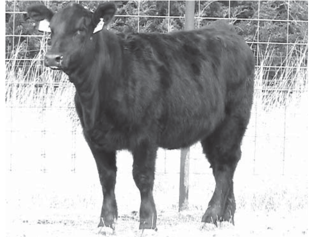
Lot 99 111U

CNS DREAM ON L186 HTP SVF IN DEW TIME HTP SVF HONEYDEW DS BLACK ZINGER 141B KD MS ZINGER 90J KD MISS LCH 600U 127G Solid Black