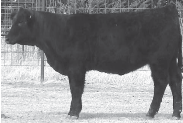
Lot 100 115U

DS MS DEW TIME 111U PB Polled 99 ASA: 2461611 Tatoo: 111U Birth Date: 3/20/08 Birth Weight: 90 205 Adj. Weight: 609 365 Adj. Weight: