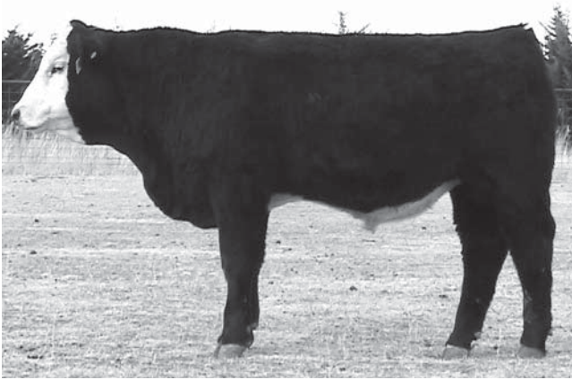
Lot 14 188U