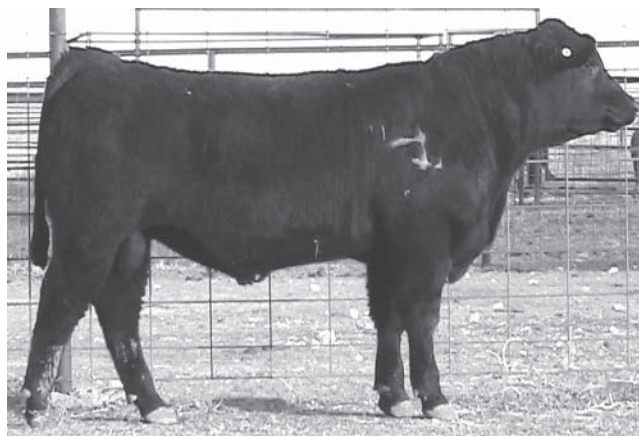
Lot 51 214U

DS MS 299N DS MS CAUFITIME 72X 419C Solid black, He has good numbers.