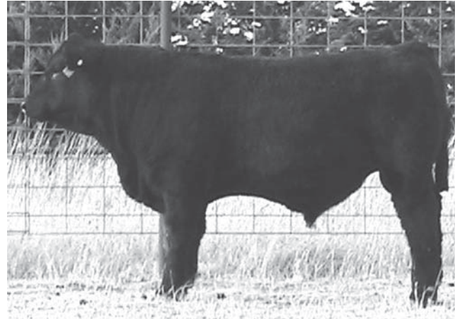
Lot 10 98U

Solid black. This is out second set of Dew Times. They have plenty of thickness and rib.