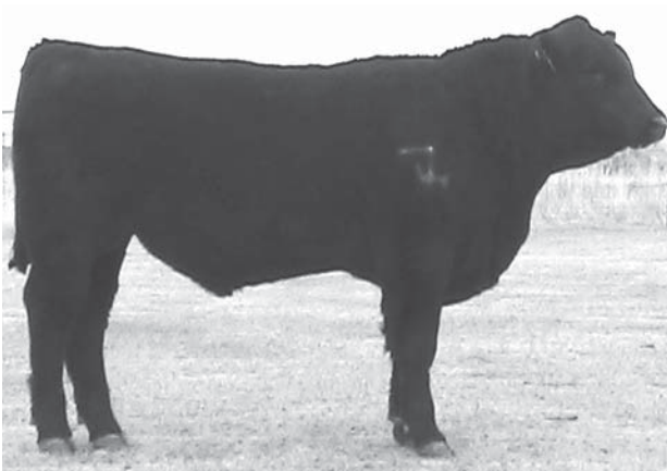
Lot 29 259U

HOOKS SHEAR FORCE 38K DS Z FORCE 179S DS ZINGER 313F 221J 473L DS SIX SHOOTER 3H DS MS SIX SHOOTER 415L DA MS BONVIEW EXT 197G Solid black. Check out his numbers, Good marbling Epd.