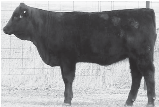
Lot 108 381U

NICHOLS LEGACY G151 DS LEGACY 128P KD MS RED LIGHT 120H 3C FULL FIGHRES C288 BLK DS MS FULL FIGURES 103L DS MS ZINGER 72H Solid Black