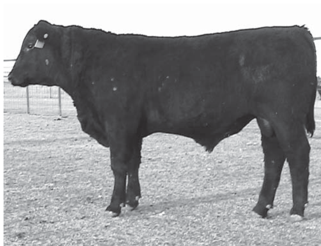
Lot 81 341U

Good wwt. His G. Dam is a pathfinder. $EN +12.17