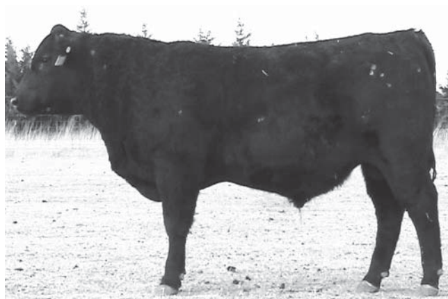
Lot 82 343U

A really good bull out of a good cow line that is easy keepin. $EN +17.40