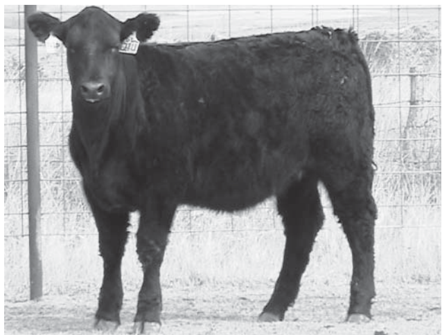
Lot 118 121U

DS MS ZINGER 121U 3/4 SM / 1/4 AN Polled