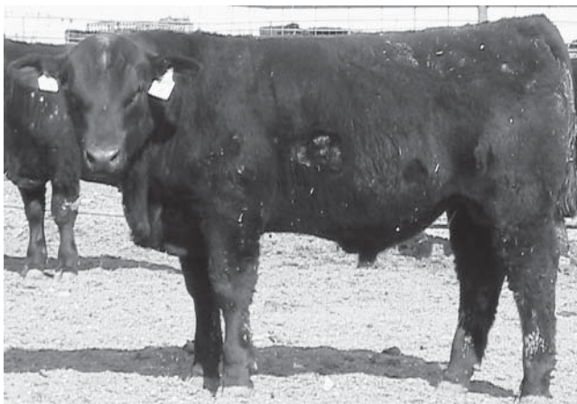
Lot 33 379U

NICHOLS LEGACY G151 DS LEGACY 128P KD MS RED LIGHT 120H DS BLACK ZINGER 141B DS MS ZINGER 176P DA MS PRIME TIME 7K Solid black. A true low input pedigree.