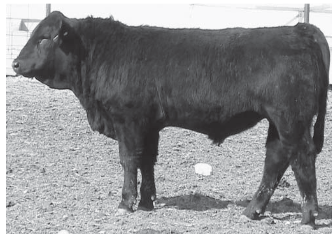
Lot 17 216U

NICHOLS LEGACY G151 DS LEGACY 128P KD MS RED LIGHT 120H DS BLACK ZINGER 141B DS MS ZINGER 154H DS MS IRONMAN 266F Solid black out of a good 10 yr old. Check out his numbers