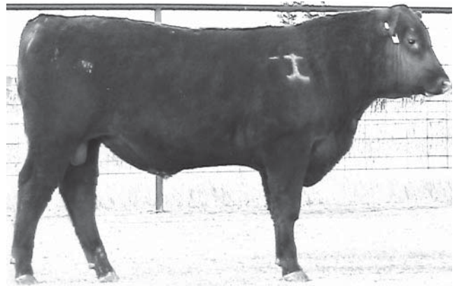
Lot 92 74U