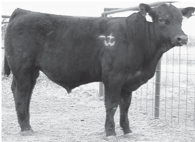
Lot 22 100U

Solid black. His out of a good cow line.