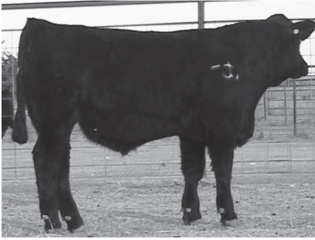
Lot 9 89U