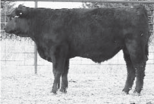
Lot 25 127U

DS SIX SHOOTER 3H DS 6 SHOOTER 151M DS MS MONTANA 329H DS ZINGER 313F 221J DS MS KDZ 221J 433L DA MS BANDO 309C 270F Solid black.