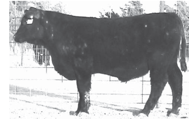
Lot 76 325U

He is out of a 14yr old cow that is still getting the job done. $EN +13.6A