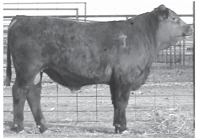
Lot 39 8U

Solid red out of a first calf heifer. He is good and will work on heifers.