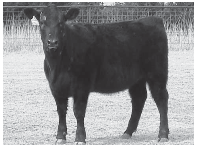
Lot 130 27U

HOOKS SHEAR FORCE 38K DS Z FORCE 179S DS MS 313F 221J 473L KD MS 533N Solid black