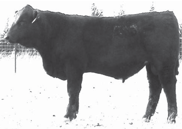
Lot 11 99U

Solid black Dew Time out of a good 6Shooter cow. He has good numbers.