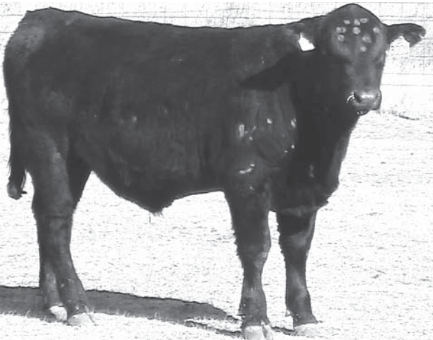
Lot 75 322U

A good bull. He sells with no Reg. papers.