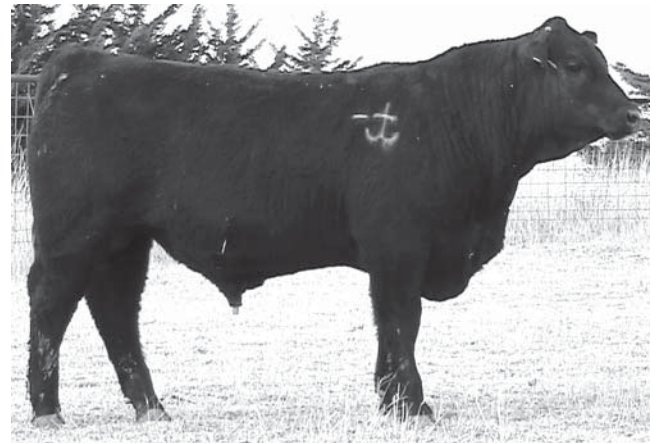
Lot 26 155U

CNS DREAM ON L186 GCF FIRST DREAM P13 BH FIRST GLANCE 88H KD ZINGER 313F KD MS KD ZINGER 313F 47R KD MS 501N Solid black. A new pedigree.