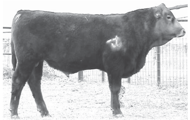
Lot 31 174U

DS SIX SHOOTER 3H DS 6 SHOOTER 151M DS MS MONTANA 329H DS 6 SHOOTER 151M DS MS 6 SHOOTER 151M 226 KD MS BLACK PENTIUM 222K Solid black. Look at his numbers.